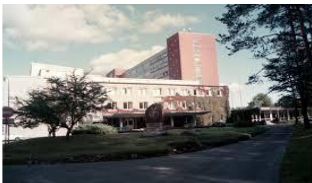
Centre of Tuberculosis and Lung Diseases