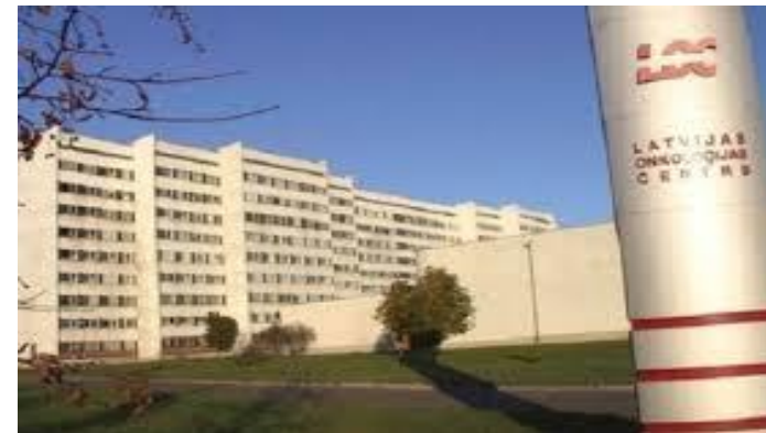
Stationary «Oncology Centre of Latvia»