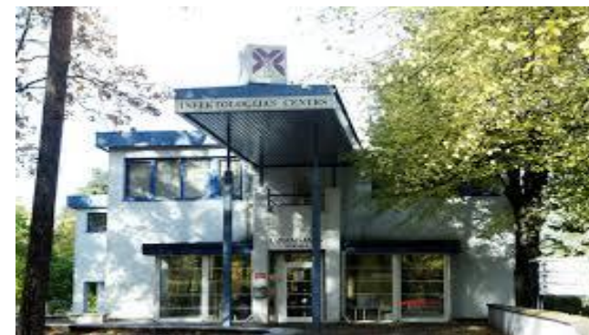
Latvian Centre of Infectious Diseases