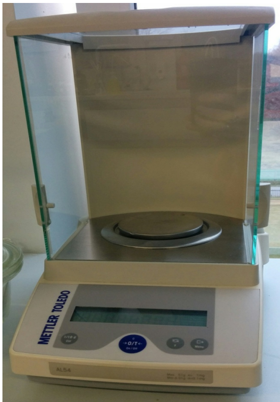
Figure 2. Analytical scale.

Illustrative material (figure, table, quote, etc.) is not consecutively presented without interim text.