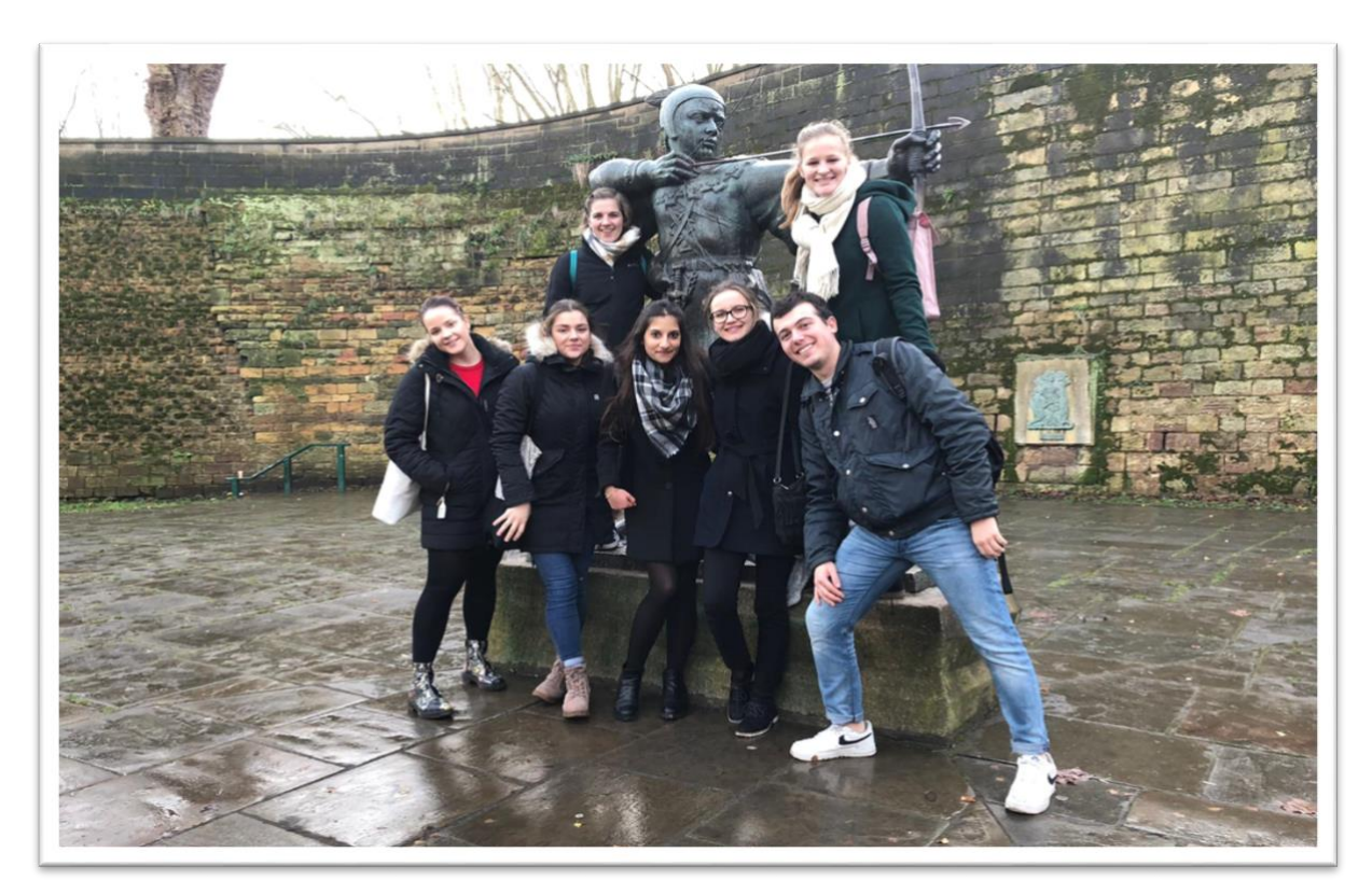
Students midwifes of the first Transnational Meeting at the University of Nottingham 2. of December - 6. of December.

On behalf of the TOTEMM-project, a colleague and I went to Nottingham. During the intensive-learning program we both have had inspiring presentations on topic regarding public health such as smoking during pregnancy and domestic violence. These presentations got me tremendously enthusiastic about the e-learning being developed. I believe that it is beneficial to address these problems with other students from different countries to get an insight in their perspectives. Besides attending the aforementioned programs, us students have wandered around town every day for sightseeing. We have been to the Christmas fair and, obviously, we ate fish and chips!